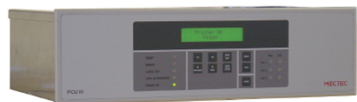
Printer Control Unit PCU III (Please note: ACC not included)