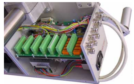
Controller and I/O:s easy accessible