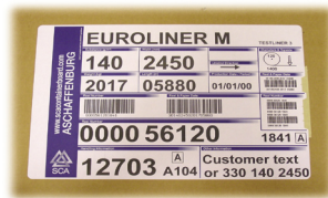
TW300 is ideal for A3 labelling within the Paper industry.