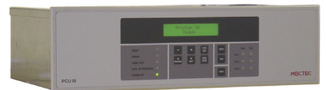
Printer Control Unit PCU III.