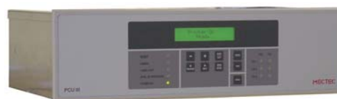
Printer Control Unit PCU III (Please note: ACC not included)